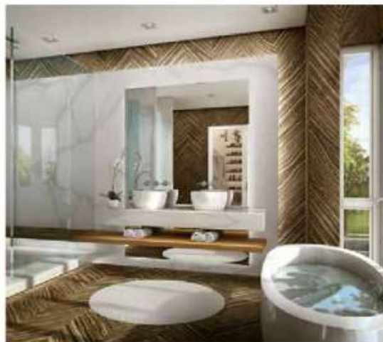
Renderings of Veridian Grove

Sabal Development affiliate 8290 Partners and One Sotheby's International Realty have partnered to build Veridian Grove, a 10.5-acre gated community of 20 custom-designed homes at 8290 SW 120th St. Each home will be built and designed by Sotolongo Salman Henderson Architects and by TOGU and feature details such as white-oak flooring, marble countertops, pool, summer kitchen, cameras, speakers and smart technology. Tropical surroundings and landscapes designed by Deena Bell of Bell Landscape Architecture include native species such as cabada and coconut palms. The community also includes a playground, a digital concierge and a wellness center with a steam room, heated lap pool and aerobics and yoga studio. For more, visit veridiangrove.com .